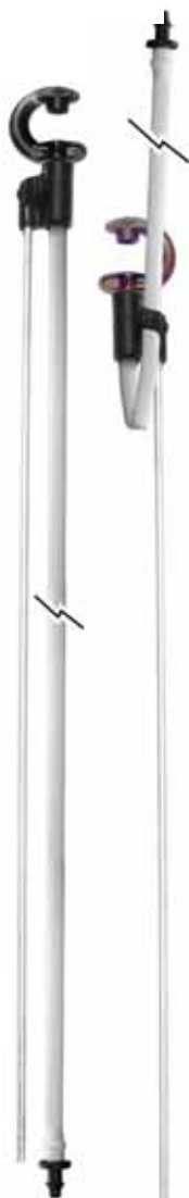
CFd® Downspray Wire Stake Assembly