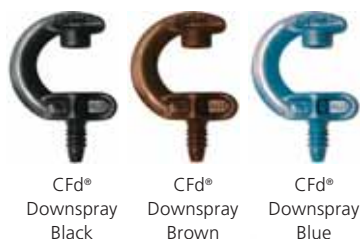
CFd® Downspray Black

Nurseries, tree lots, potted plants, home and landscaped gardens.